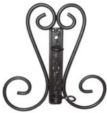
2 pcs – Main Holder